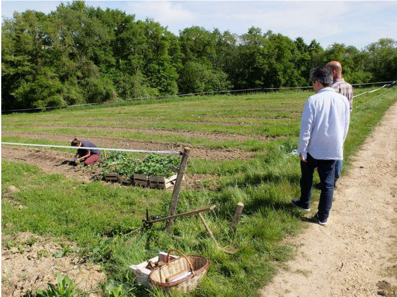
The ripped-out vineyard remains fallow and is planted with grass, including some vegetables for dining table.